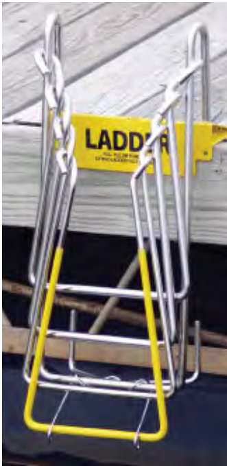
Retractable Up and Out Safety Ladder