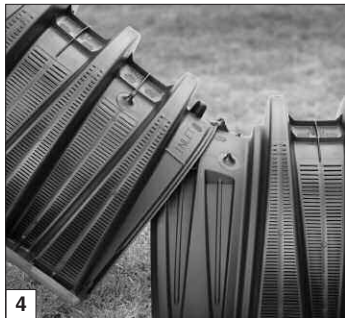
Connect the chambers.

Note: When the chamber end is placed between the connector hook and locking pin at a 90-degree angle, the pin will be visible from the back side of the chamber.