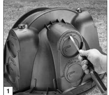
1 Start tear-out seal.