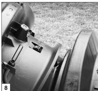
Attach end cap to chamber.

lower the end cap to the ground to snap it into place. Do not remove the tear-out seal.