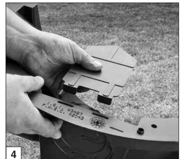
4 Install splash plate.