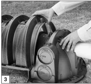
Place first chamber onto end cap.