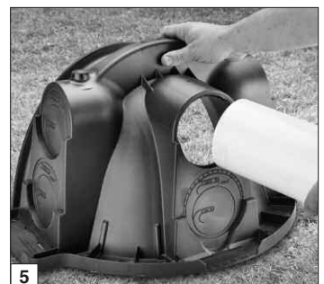
5 Insert inlet pipe.