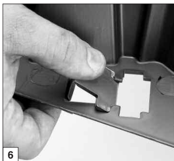
Activate StraightLock™ Tabs.