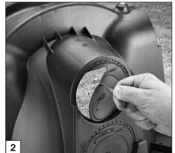
2 Pull tab on tear-out seal.