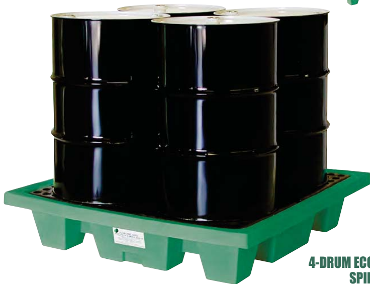
4-DRUM ECO POLY-SLIM-LINE SPILLPALLET™