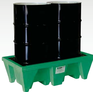
2-DRUM ECO POLY-SPILLPALLET™