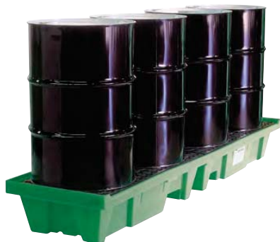
4-DRUM ECO IN-LINE POLY-SPILLPALLET™