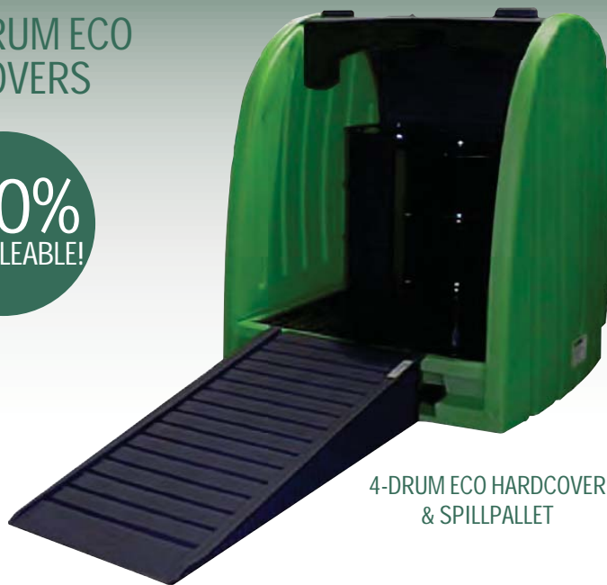
4-DRUM ECO HARDCOVER & SPILLPALLET