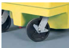
Rear casters pivot 360° to let you move around freely; each with wheel brakes for securing position.