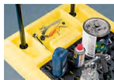
Built-in tool tray keeps tools and other small objects clean and handy.