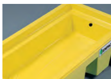
Large internal sump holds incidental spills.