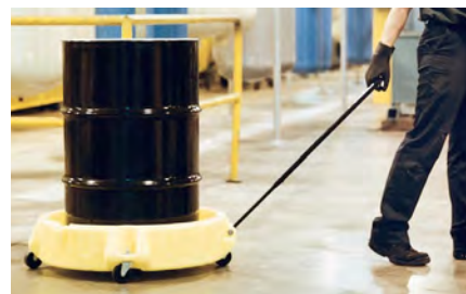
Shown with optional metal T-Handle (Part # 5206-BK).

Incidental spills and drips are contained in the well with a spout for easy draining. The Spill Scooter™ fits all drums up to 55 gallons. Made of 100% polyethylene, the Spill Scooter™ will not rust or corrode.