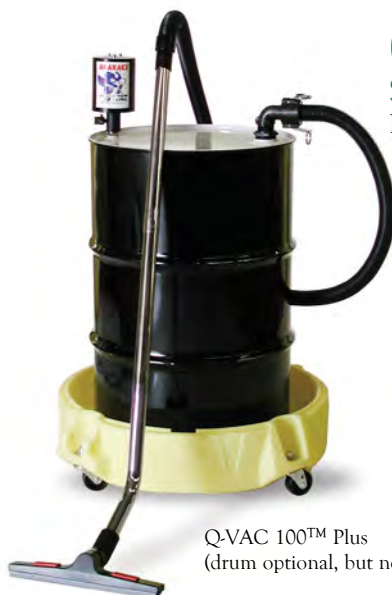
Q-VAC 100™ Plus (drum optional, but not included)