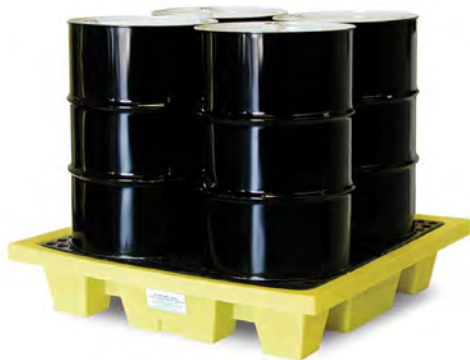
Optional tarp available (Part # 5400-TARP, p. 11)