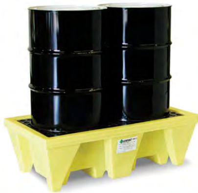
Optional tarp available (Part # 5253-TARP, p. 11)