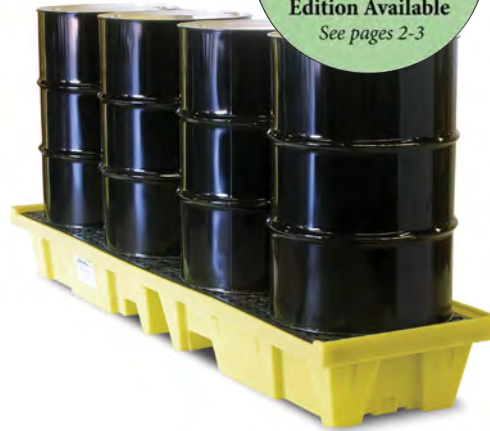
Optional tarp available (Part # 5102-TARP, p. 11)