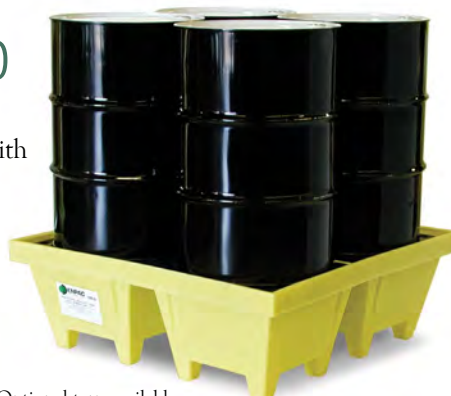
Optional tarp available (Part # 5001-TARP, p. 11)